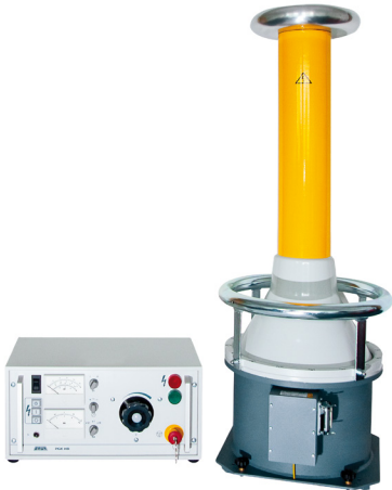
The figure is illustrative.